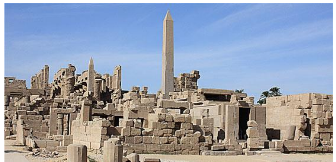
Pic1- Temple of Karnak, https://en.wikipedia.org/wiki/Karnak

Due to the availability of materials, the Egyptians have reached advanced methods of exploration of stones and minerals, transporting, lifting, cutting and polishing, which led to the advantage of Egyptian architecture by the giant scale. The Pharaonic large forms, whether a pylon or an entrance, are huge in their details because they are relatively weak sandstone in the formation. [11]