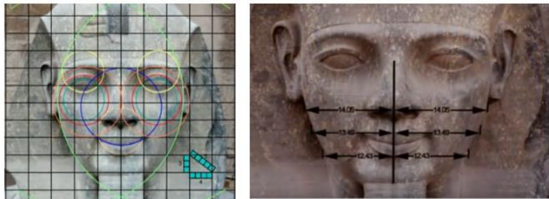
Pic5 - symmetry of statues in Egypt, (Dunn 2010)

Christopher Dunn re-examined other statues of Ramses II in Memphis and the British Museum to come to the same conclusion, the perfect symmetry between the two halves of the face. [5] Ancient inscriptions show the great relationship between humans and the universe through the sun, moon, stars, cosmic energy paths and everything they knew about astronomy at that time. [15]