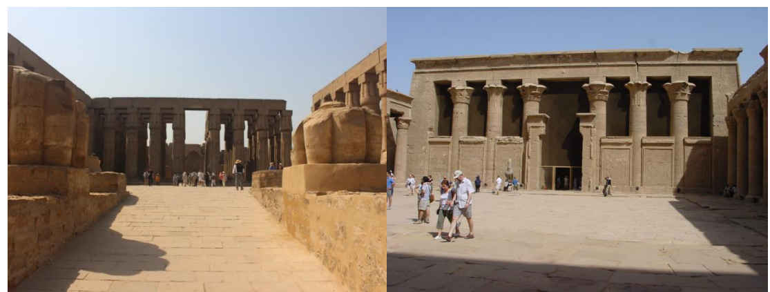
Pic2,3- Luxor temple https://en.wikipedia.org/wiki/Luxor_Temple

As the effect of winds and their direction appeared on the shape of the building plans, the wind catchers appeared to exploit the desired winds. The ancient Egyptian also took care of providing stone barriers in the cooking areas in residential buildings.